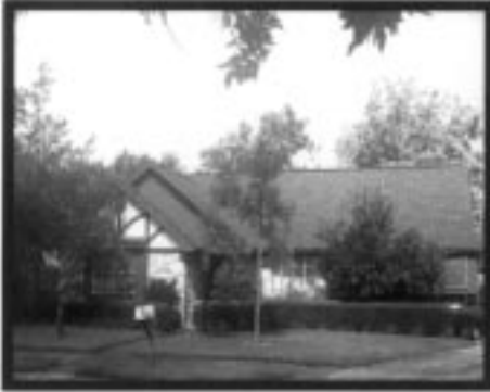
11706 BOLERO COURT

RE/MAX SOUTHWEST REALTORS PRESENTS NEW HOMES ON THE MARKET