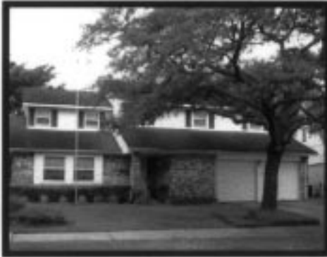
12034 CEDAR FORM