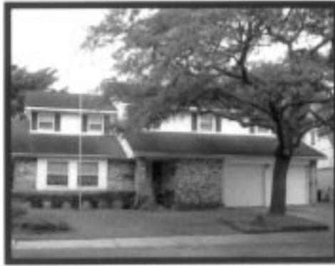
12034 CEDAR FORM