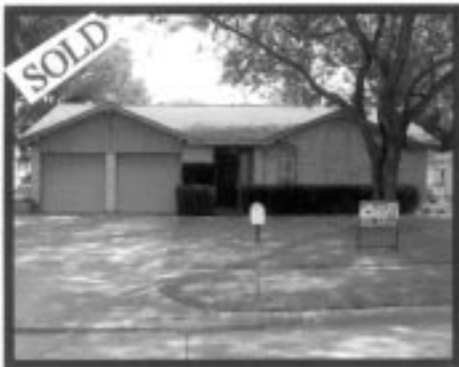
11418 BROOK MEADOW

RE/MAX SOUTHWEST REALTORS PRESENTS NEW HOMES ON THE MARKET