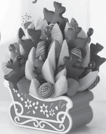
Reindeer Sleight Ride Bouquet™ with Swizzle Berries® & Apples