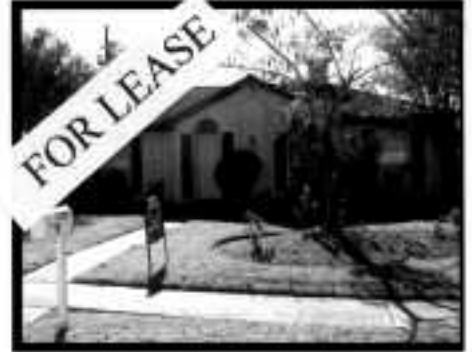
11432 BROOK MEADOW