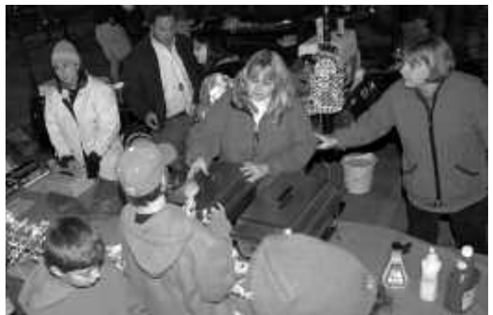
Baseball and Swim Team kept everyone fed

Warm beverages and plenty of food were available thanks to Meadows All Play Baseball League and Meadows Marlins Swim Team. Thanks to everyone who help participated and helped make this another great Christmas Memories in the Park.