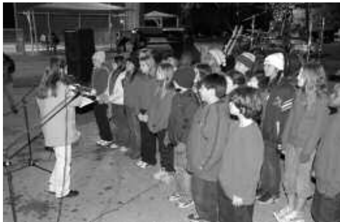
Meadows Elementary Choir