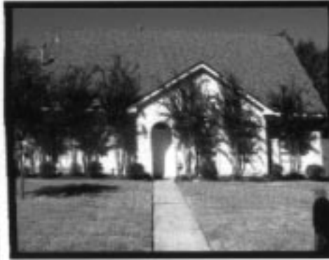
11802 MONTICETO CT.