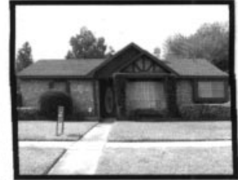
12239 MEADOW HOLLOW