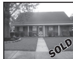
12010 Blair Meadow