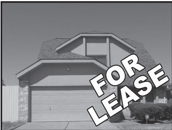
11834 Oak Meadow