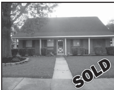
12010 Blair Meadow