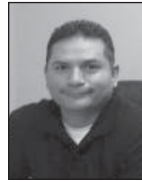
By Danny Segundo

B rown grass, dead shrubs, puny gardens — they're an eyesore for sure. But keeping your yard in pristine shape can be quite a burden, especially in the summer heat, when drought conditions are rampant. Here are seven tips to keep your yard looking its best, without wasting water.