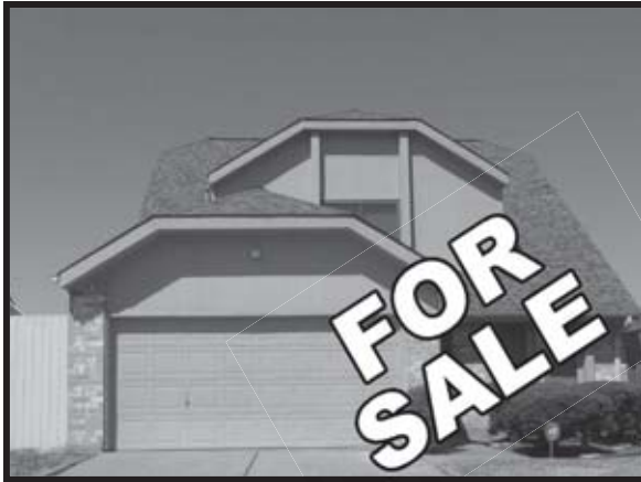
11834 Oak Meadow

BEARD REALTY GROUP PRESENTS MEADOWS PLACE HOMES ON THE MARKET FOR APRIL