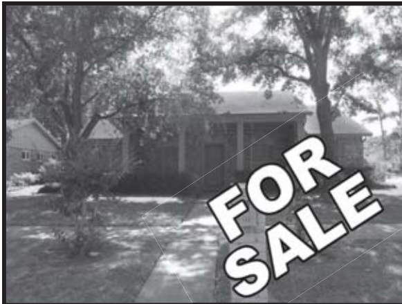
11723 Bolero Court