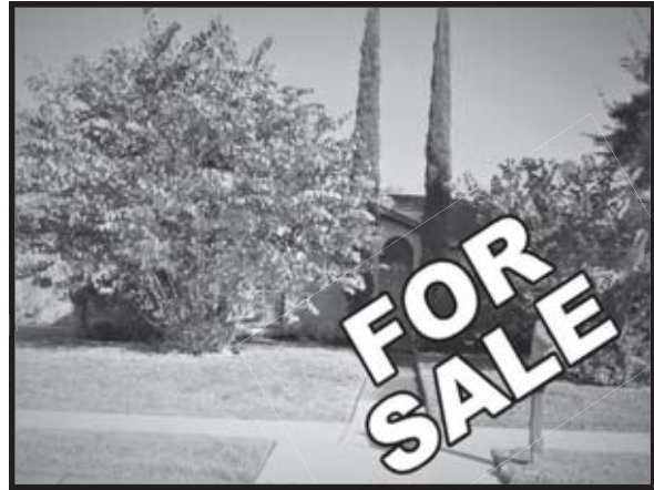
11602 Brook Meadows