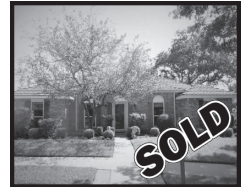
11703 Bolero Ct