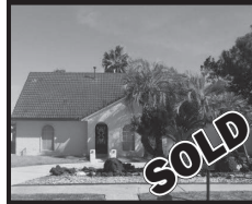
12002 Meadow Hollow