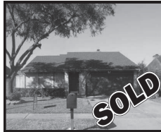
11850 Meadow Crest