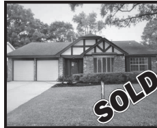
12242 Meadow Hollow