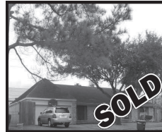
11811 Meadow Crest