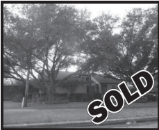
11614 Blair Meadow