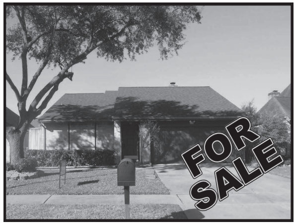
11850 Meadow Crest