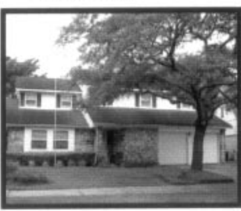
12034 CEDAR FORM