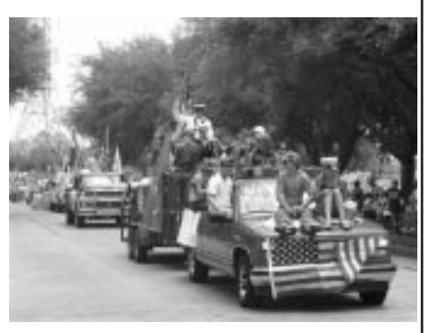
1st Place Youth Group/Individual Meadows Place Lifeguard Float Representing all our armed forces.