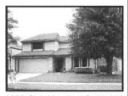
1822 Oak Meadow $151,900

To get more for your dollar simply click on Meadows Place Homes.