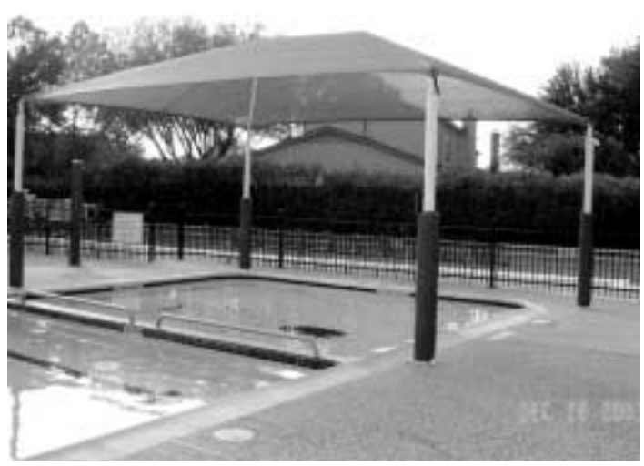
New awesome shade structures have been put over the city "baby pool" at the Community Center and the bleachers at the baseball field. Eventually, we plan to place these around the city in other areas as well.