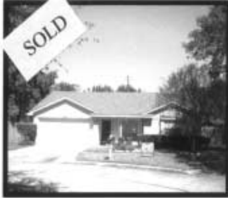
11702 SOLANO COURT

EMAIL: anita@anitamilne.com WWW.ANITAMILNE.COM