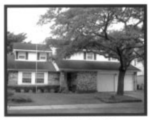
12034 CEDAR FORM