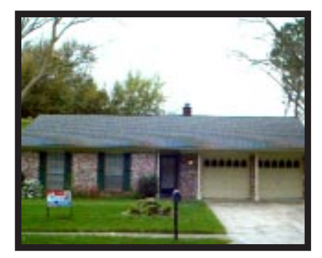
""33537"DTK I J VQP