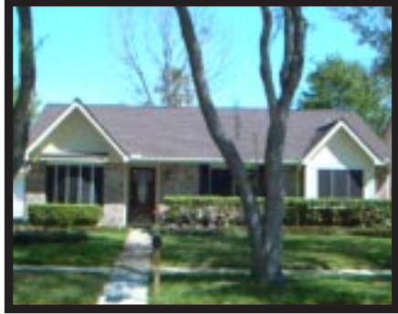
34468" OGCFQY" JQNNQY