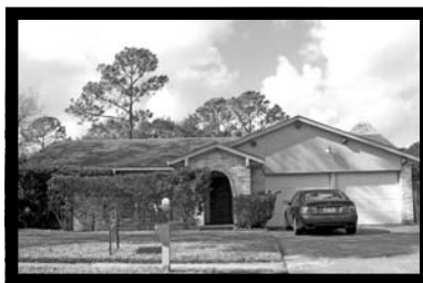
11910 MEADOW TRAIL