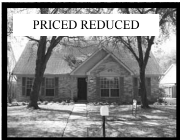
11710 KENZIE CT.