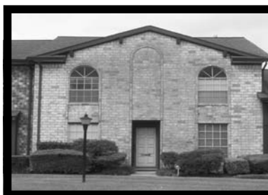
11528 SOUTH KIRKWOOD