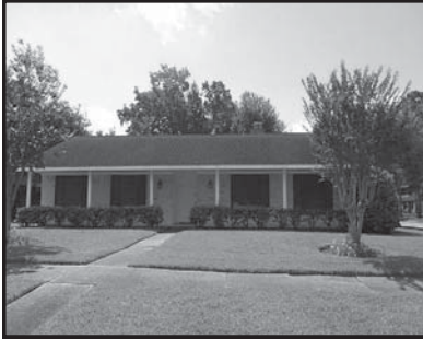
11915 Blair Meadow

BEARD REALTY GROUP PRESENTS MEADOWS PLACE HOMES ON THE MARKET FOR SEPTEMBER