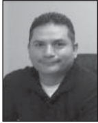
By Danny Segundo

Storm water runoff from urban areas can carry pollutants and trash into the storm water drainage system. Water that flows down the drains in our homes first goes to sewage treatment facilities before it's released to bayous and rivers. But, water that flows into our storm water drainage system, along with other substances it collects, goes directly into our bayous, rivers, and ultimately into Galveston Bay. Unlike sewage, storm water receives no treatment.