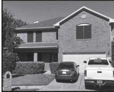
12211 Pamela Sue Ct