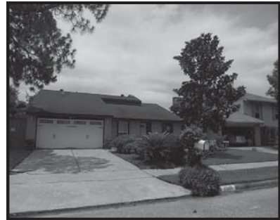
11958 River Meadow