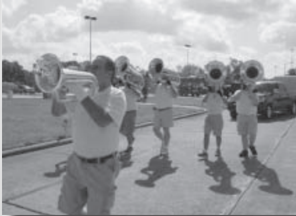
Gulf Coast Sound pleasing the crowd with their patriotic tunes.