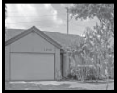
11719 BROOK MEADOW