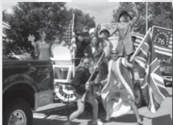
Meadows Place Lifeguards and 1st Place winners in the Youth Category dress as American icons to show their love of America.