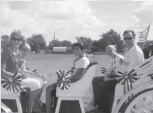
Congressman Pete Olson and family eagerly awaiting the start of the parade.