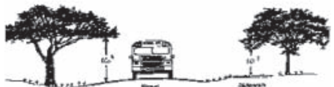
Street Cross Section - Minimum Tree Clearances 16' over streets 10' over sidewalks

For information on tree care and maintenance check out: www.treesaregood.com ; www.arborday.org ; www.fsfed.us .