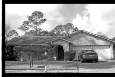
11910 MEADOW TRAIL