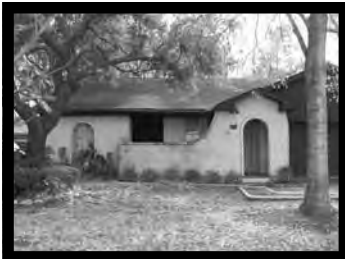
12315 LEVEL RUN