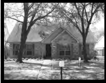
11710 KENZIE CT.