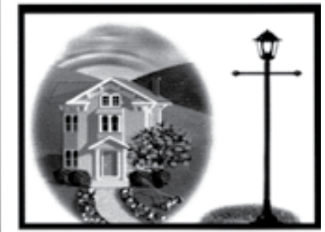
COULD BE YOURS

WHEN IT COMES TO YOUR HOME IN MEADOWS PLACE