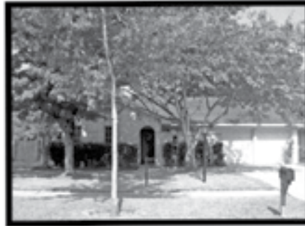
12022 BLAIR MEADOW