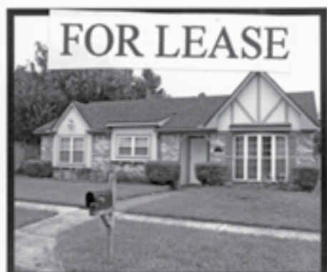
11711 KANGAROO CT.