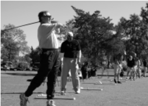
Getting in that last minute practice.....