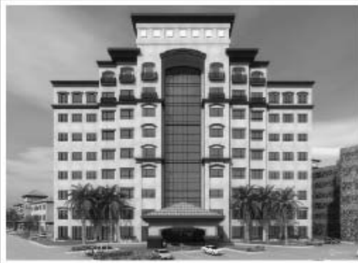
Medical Office Building