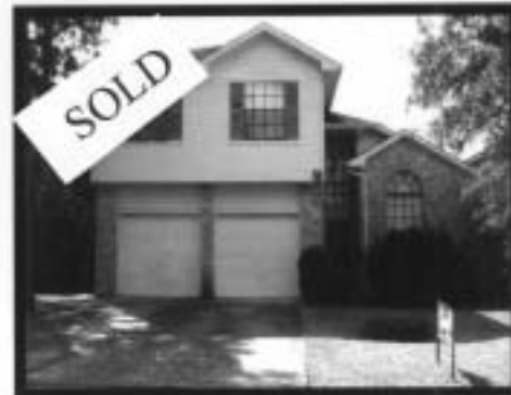
12319 MEADOW CREST