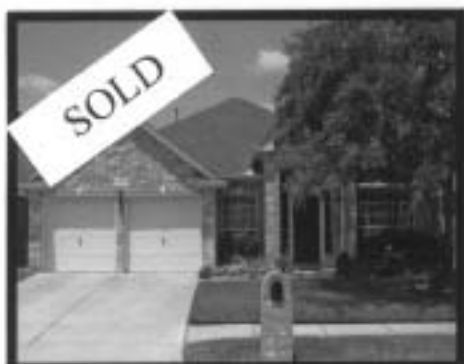
12210 MEADOW PARK

RE/MAX SOUTHWEST REALTORS PRESENTS NEW HOMES ON THE MARKET