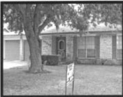
11314 BROOK MEADOW