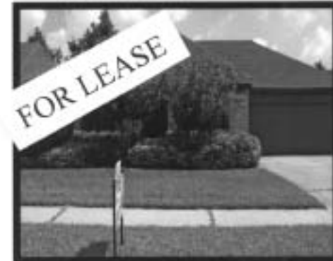
11830 MEADOW CREST