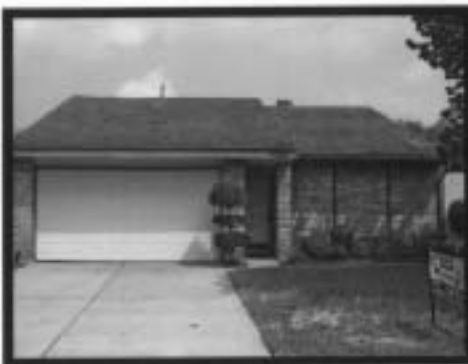
11934 RIVER MEADOW