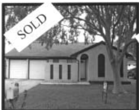
12034 MEADOW HOLLOW