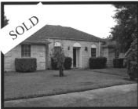
12202 MEADOW HOLLOW