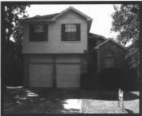
12319 MEADOW CREST