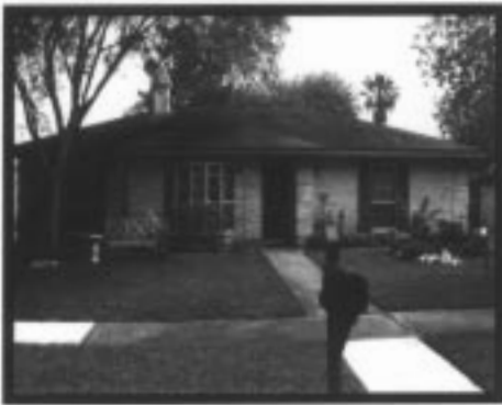
12302 MEADOW HOLLOW

RE/MAX SOUTHWEST REALTORS PRESENTS NEW HOMES ON THE MARKET