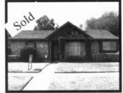
12239 MEADOW HOLLOW