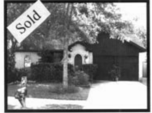
12315 LEVEL RUN