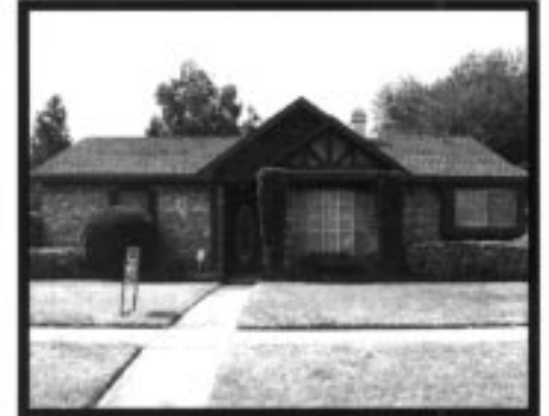
12239 MEADOW HOLLOW