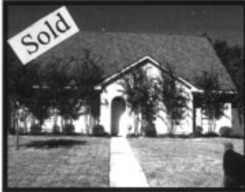
11802 MONTICETO CT.