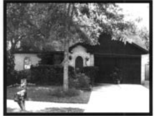
12315 LEVEL RUN