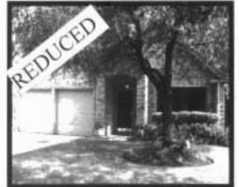
12506 BROOK MEADOW

CALL ANITA FOR THE MOST UP TO DATE INFORMATION: