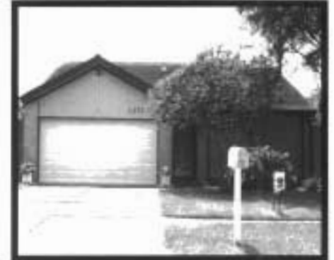
11719 BROOK MEADOW