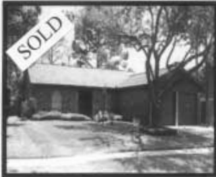
11831 BLAIR MEADOW

RE/MAX SOUTHWEST REALTORS PRESENTS NEW HOMES ON THE MARKET