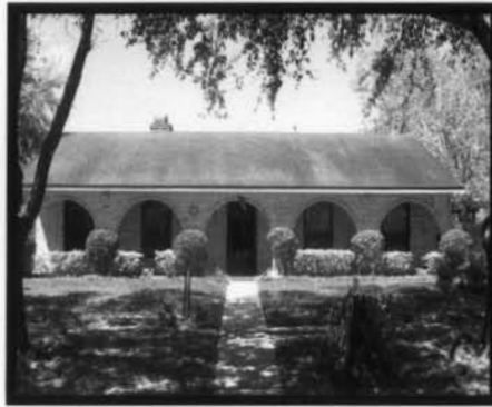
11710 BLAIR MEAD-