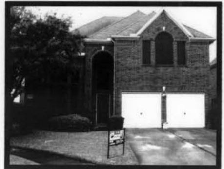
12210 QUIET MEADOW