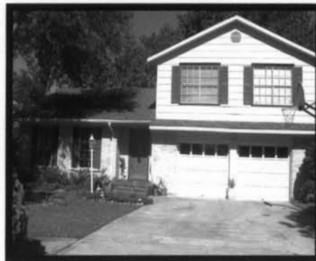
11706 BLAIR MEADOW