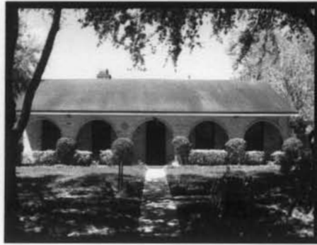
11710 BLAIR MEADOW