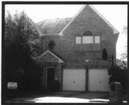
12219 QUIET MEADOW