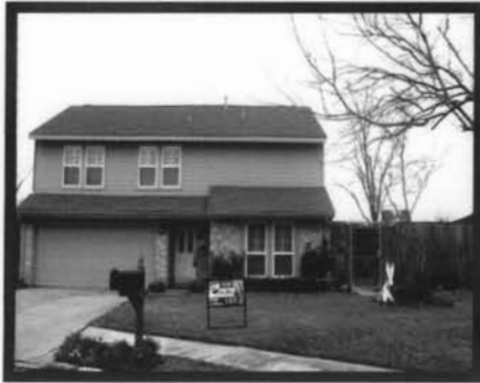
11806 OAK MEADOW

RE/MAX SOUTHWEST REALTORS PRESENTS NEW HOMES ON THE MARKET