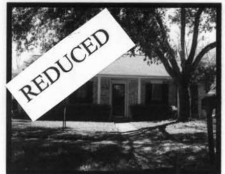
11715 BOLERO CT