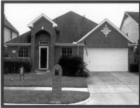
12207 QUIET MEADOW