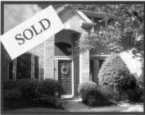
12214 MEADOW CREST