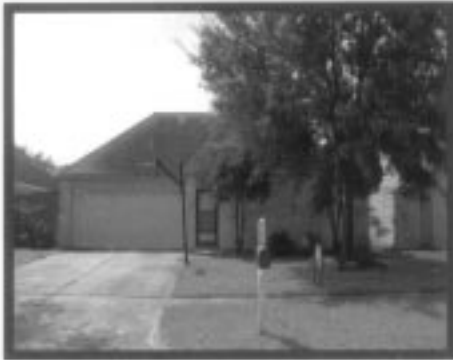
11815 BROOK MEADOW

RE/MAX SOUTHWEST REALTORS PRESENTS NEW HOMES ON THE MARKET