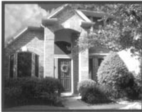
12214 MEADOW CREST