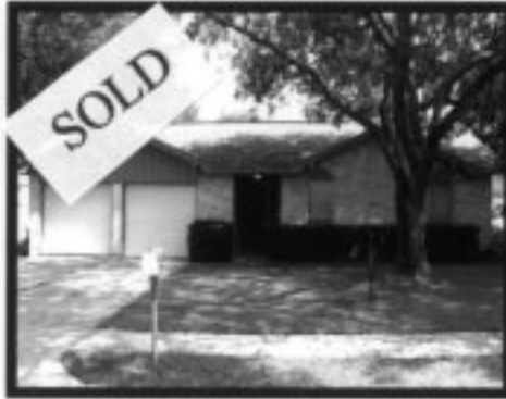
11418 BROOK MEADOW