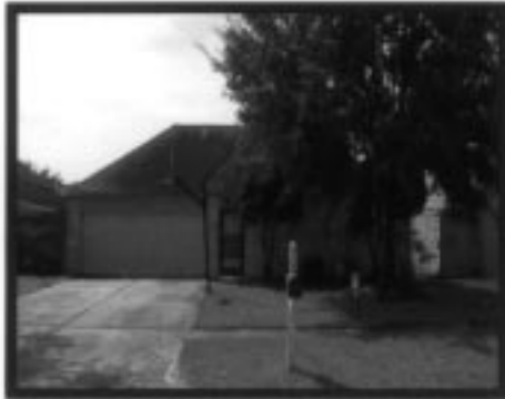
11815 BROOK MEADOW

RE/MAX SOUTHWEST REALTORS PRESENTS NEW HOMES ON THE MARKET