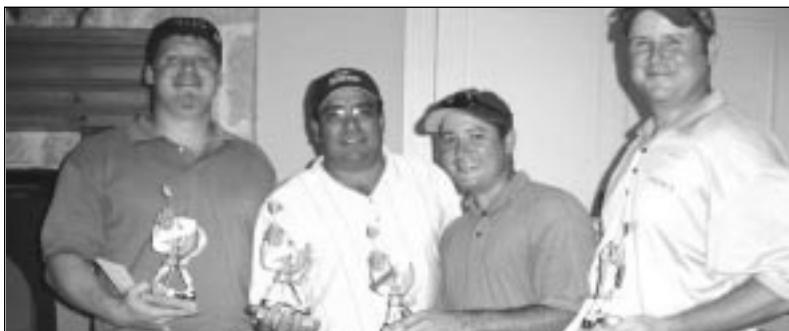
1st Place Winners of this year's tournament