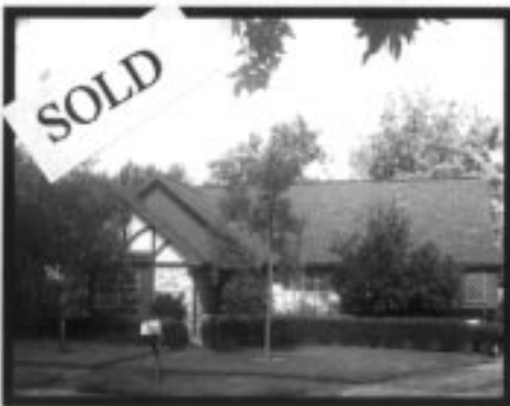
11706 BOLERO COURT